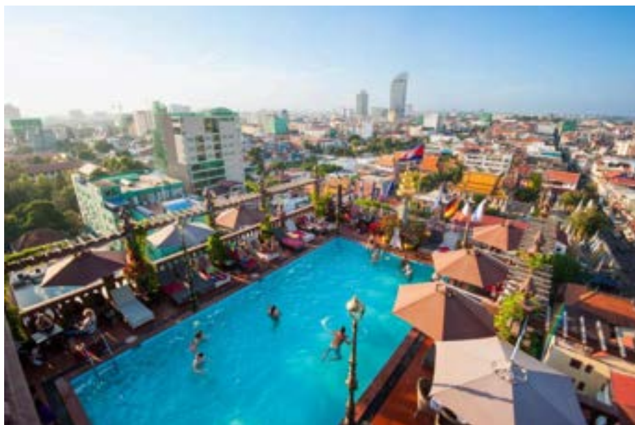
Okay Boutique Hotel Rooftop Pool with City View