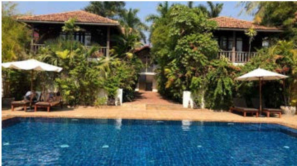
Bambu Battambang Hotel